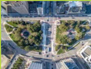
GRAND CIRCUS PARK