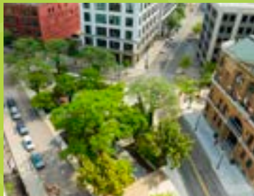
PARADISE VALLEY PARK AND PLAZA